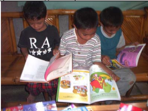
Schoolchildren of Mahongkog Elementary School scan the books. They are amazed with the colorful pictures they see.