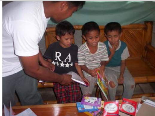
Faces of school children light up as the books are handed to them.