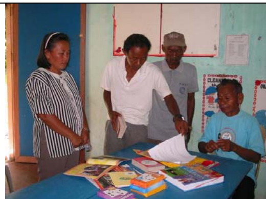
Datu Sundungan barangay officials inspecting the books from Move on Philippines and thanking MinLand and Move On Phils for the kind heart they have for poor school children.