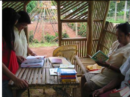
Doles Barangay officials and community residents scrutinizing the contents of the package and saying their thanks to Move On Philippines and MinLand.