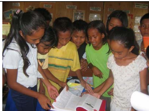
The school children gather around the newly turned over educational materials to take a closer look on them.