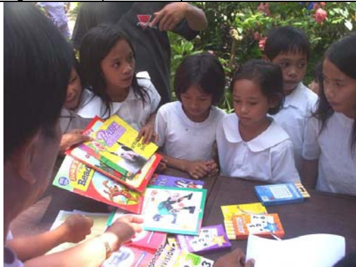
The children take a look on what they will have to read and learn from the educational materials given to them.