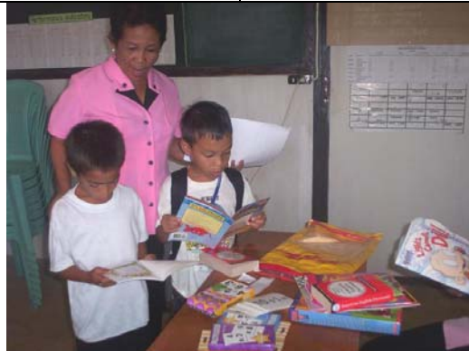
Pupils of Ilustre Elementary School scan the books with curiosity.