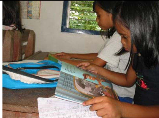
Pupils of Rodero Elementary School are hooked in the storybooks they are reading. The books are illustrated and colorful and kids just can't help but read them soon after the package was opened.