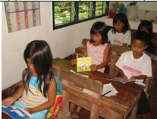
Pupils of Rodero Elementary School immediately read the books given to them by Move On Philippines after the very short turnover ceremony.