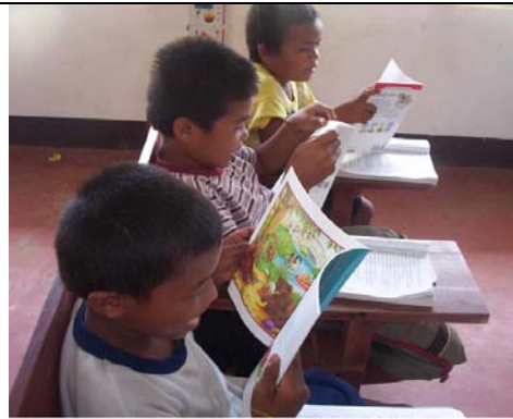
Pupils of Ilian Elementary School take pleasure in reading of these very well illustrated storybooks given to them by Move on Philippines.