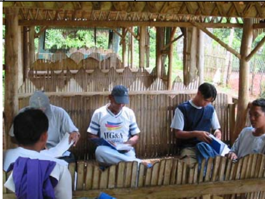
Move On donated books look like they are not just intended for school children. Council members look engrossed with what they are reading.