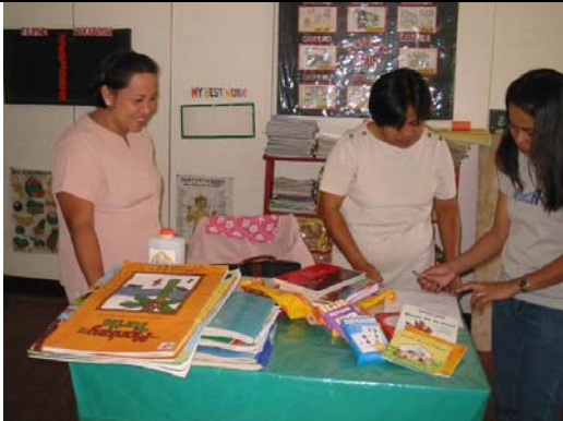
A teacher smiles upon seeing the educational materials donated by Move On Philippines. They expressed belief that these materials will be helpful in improving the learning processes of their pupils