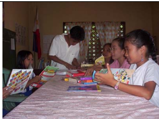
The faces of children show pleasure in having additional books to read in their leisure time.