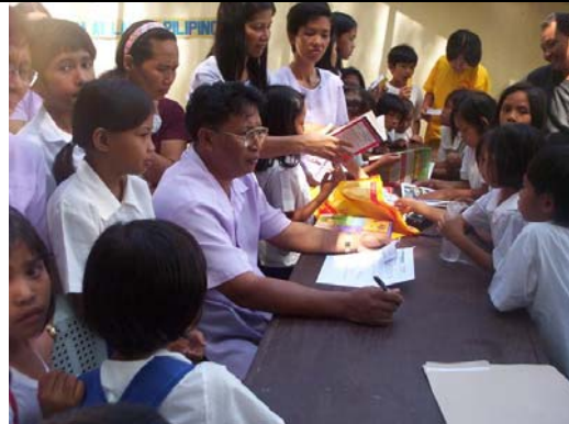
Sagkungan barangay officials, teachers and pupils of Sagkungan Elementary School and their parents huddle to see for themselves the educational materials given to their school.