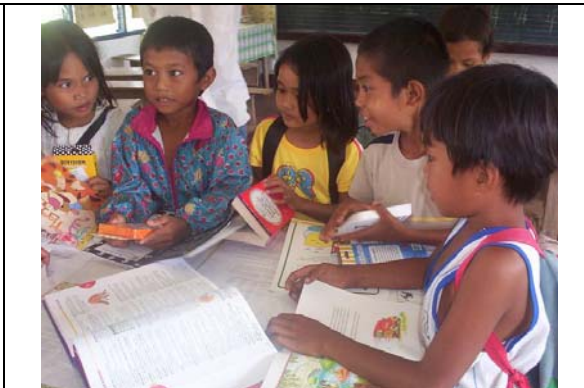
Pupils unable to hold back their delight upon getting hold of the educational materials they received from Move On Philippines.