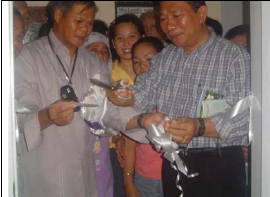
A ribbon cutting ceremonial launching the Engineering and Computer Graphics Laboratory, where most of the donated computer parts were utilized, was also part of the program.