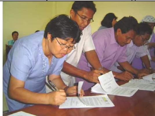
Signing of transmittal letter...