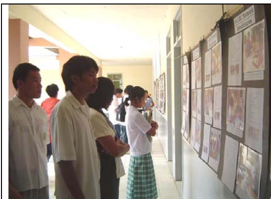
USM students could not help but notice the photo exhibit situated outside of the rooms in CENCOM building, near the CENCOM Auditorium, where the program is held. They are scanning pictures to see whether the barangay or schools where they are coming from is one of the beneficiaries of the Move On Philippines donations.