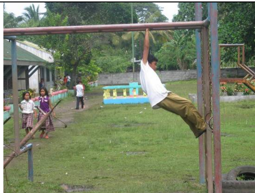
Pupils are allowed to play during break time.