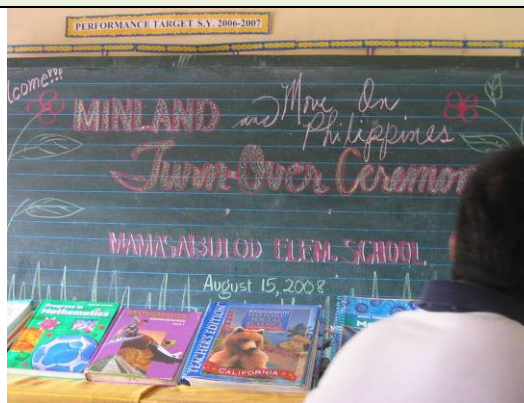
Turn-over is conducted in the Principal Office. The box intended for Mamasabulod Elementary School was opened and the books were arranged and displayed before the start of the program.