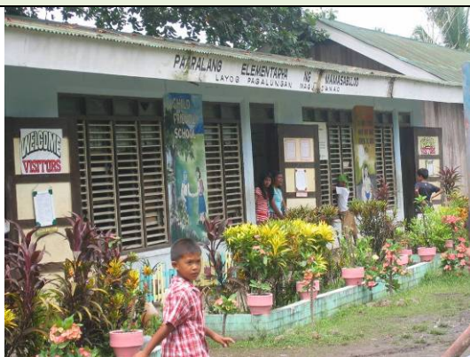
School building of Mamasabulod Elementary School. Boxes of books that arrive in the school catch the attention of some pupils.

Turnover of Educational Materials to Mamasabulod Elementary School, Pagalungan, Maguindanao Dalgan Elementary School, Pagalungan, Maguindanao Kalbugan Elementary School, Pagalungan, Maguindanao Datakaya Elementary School, Pagalungan, Maguindanao at Mamasabulod Elementary School, Pagalungan, Maguindanao August 15, 2008 9:30 a.m.