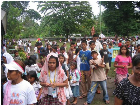
Pupils and Teachers are busy in preparation of their upcoming celebration of Municipal Foundation Day.