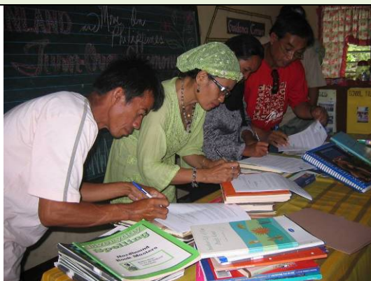
Signing of the transmittal letter