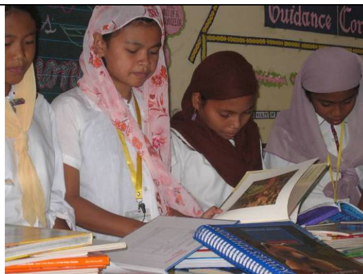
Grade Six pupils of Mamasabulod Elementary School give time for scanning and reading some contents of the books.