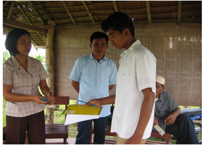
2 nd year student receives the school supplies from Move On Philippines, Inc. He expressed his thanks to MOP for the donations.