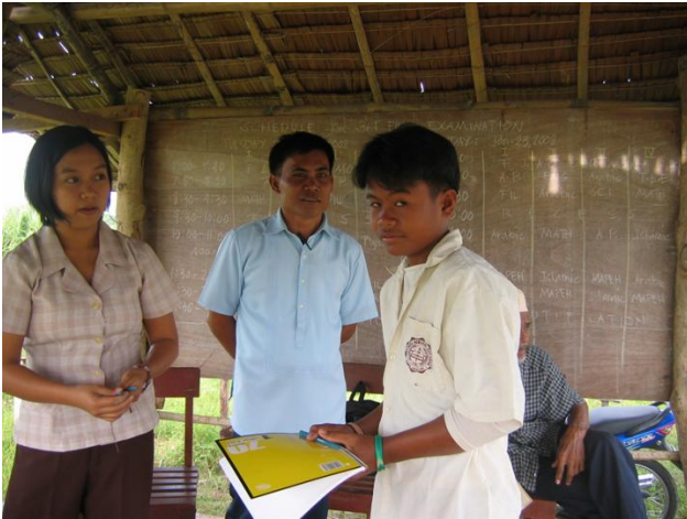
The school teachers equally distributed the school supplies to the students. All students expressed their many thanks to the MOP and MinLand for the donations.