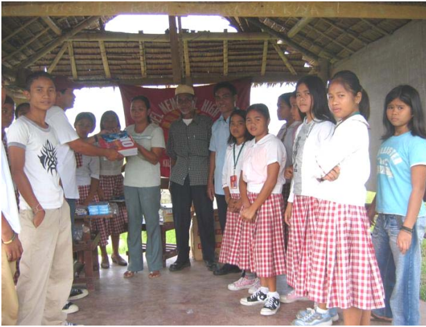
Ceremonial turnover of the school supplies from Move On Philippines to Datu Ambel Memorial High School in Barangay Kilada, Matalam Cotabato.