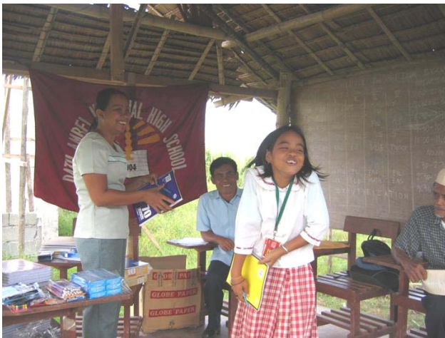
Female student receives happily the donated school supplies from Move On Philippines International, Inc.