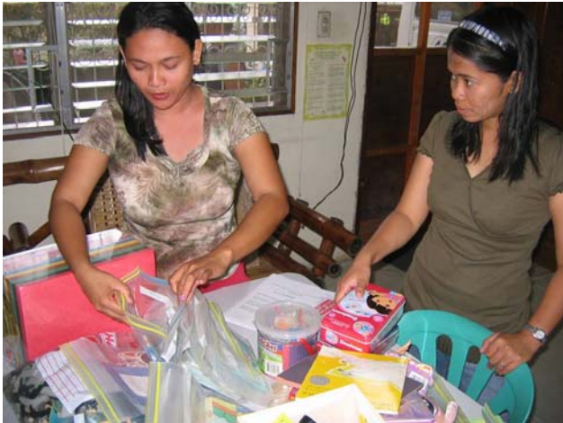
Continue checking of the educational materials.