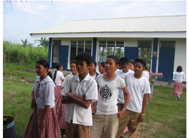
Following the instruction of their teachers, the first year high school students formed their line immediately. They are the one who receives first the MOP donation.