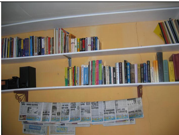
Some of the newly acquired books will go to MINSIED Library and the other books will go to MINSIED partner communities.