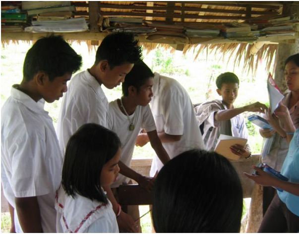
Students share impressions with each other of what they received, some of them encourage to exchange the item they received to others.