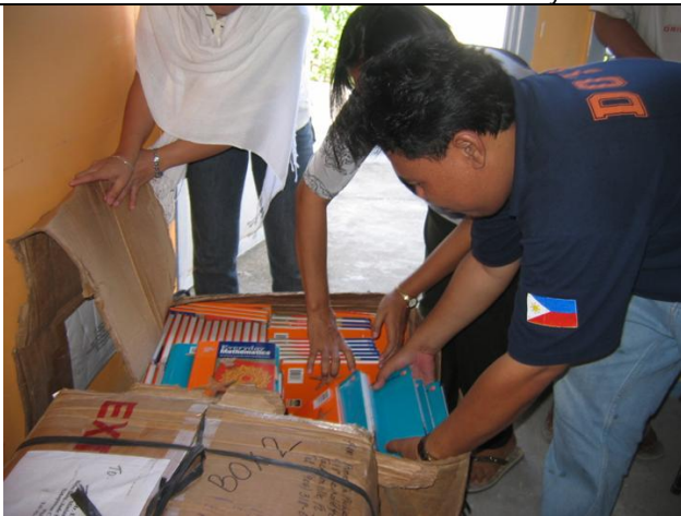
Opening of the boxes of books