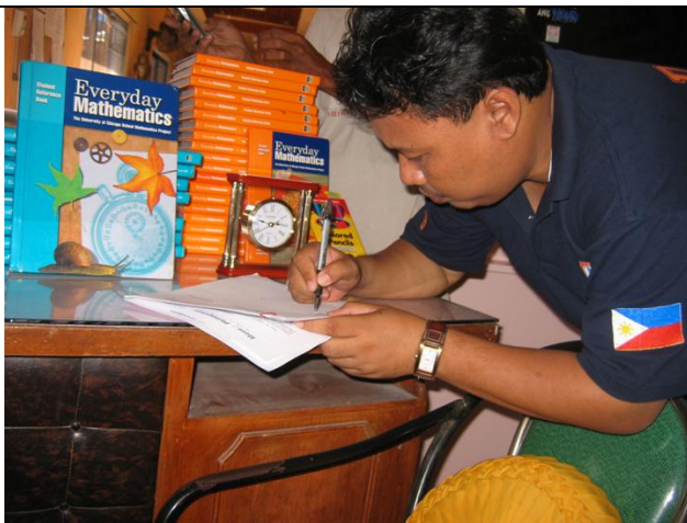
Signing of transmittal letter of Move On Philippines