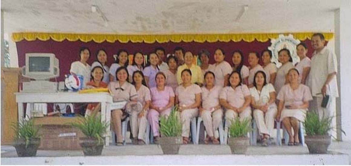
Teachers and staff of Camanlangan Elementary School with the donated PC and books. Camanlangan is in Mindanao's Compostela Province, five to six hours northeast of Davao City through rough roads and mountainous forested terrain.