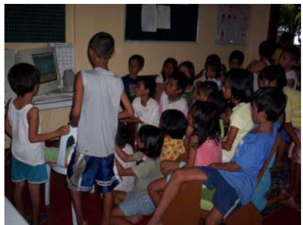
Students of Guadalupe Elementary School, Leyte viewing video clips displayed by the encyclopedia software installed on a PC donated by Move On Philippines.

Special Projects - - Upon approval of Trustees, Move On Philippines will implement special projects that facilitate access to educational resources by a large number of beneficiaries.