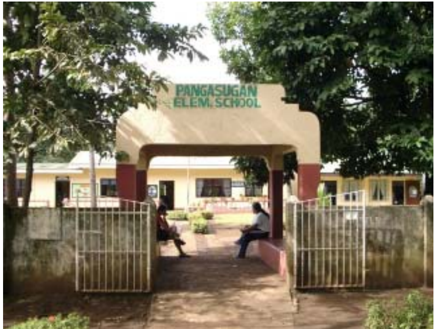
Entrance of Pangasugan Elementary School, Leyte

Classroom Supplies - Move On Philippines will provide basic classroom supplies such as notebooks, writing paper, pens and pencils, crayons, etc.