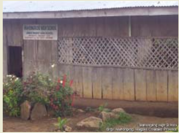
Classroom of Mahongkog High School, Magpet Cotabato