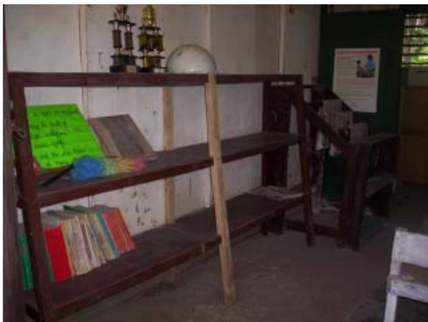
Library of Hilaan Elementary School, Leyte prior to applying for program assistance.

Emergency Relief - In times of natural disasters in the Philippines (earthquakes, typhoons, landslides and similar catastrophes), Move On Philippines will provide emergency relief to communities in need by coordinating shipments of used clothing and other basic necessities to communities in need.